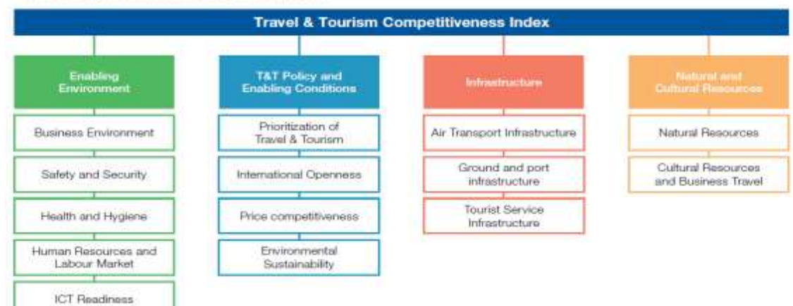
Figure 1: The T&T competitiveness Index 2017 framework

The TTCI is structured into four sub-indexes, 14 pillars, and 90 individual indicators. The subindexes of the Index are as follows: (1) The Enabling Environment sub-index; (2) The T&T Policy and Enabling Conditions sub-index (3) The Infrastructure sub-index and (4) The Natural and Cultural Resources sub-index.Each of these sub-indexes is built up by a number of pillars of T&T competitiveness which are in turn divided into indicators (Fig. 1)(T&T Competitiveness Report, 2017). These indexes can be used by tourism stakeholders and policy makers of the tourism destinations to assess their destination competitiveness in comparison to other competitive destinations and hereby find solutions to enhance their competitive capabilities to attract more tourists.