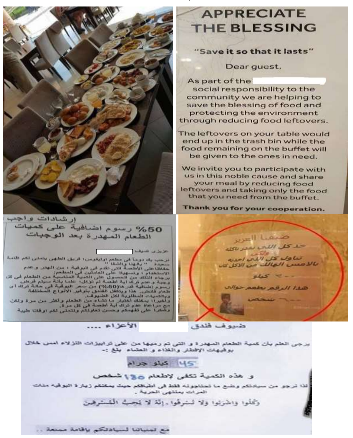
Figure 2. Exemplary photographs of observed food leftovers (original photographs in color and high resolution)

International Conference of the African Association of Agricultural Economists, September 22-25, Hammamet.