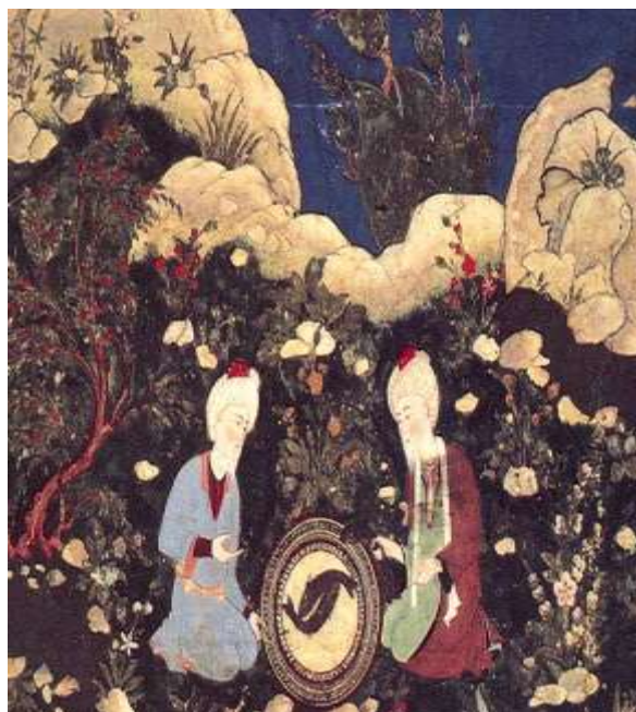
IL.10 -The prophet Elias and Al-Khiḍr at the fountain of life. A Folio from a khamsa Nizami , late 15th century. Timurid art school, Freer Gallery museum of Art, Smithsonian Institution.