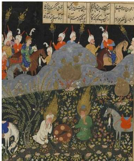
IL.9 -Al-Khiḍr and the prophet Ilyas (Elias) at the Fountain of Life. a miniature from manuscript Khamsa Nizami Shirazand ,1548 A.D.

Stchoukine I. (1966), La Peinture Turque d'Après les Manuscrits Illustrés de Sulayman Ier à 'Osman II (1520-1622), Paris, P.12