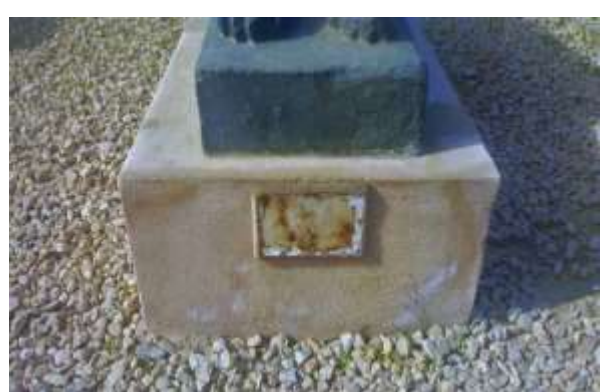
Figure 11: Lack of information sign