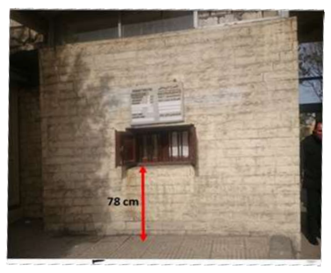
Figure 10: Roman Theater: height of information / ticket desks