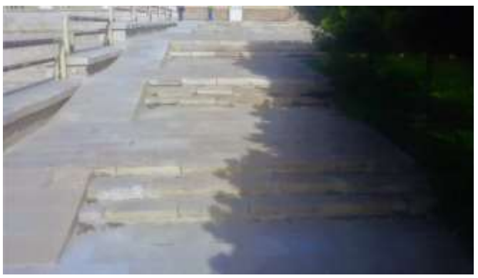
Figure 12: Ramps lead to the Pillar