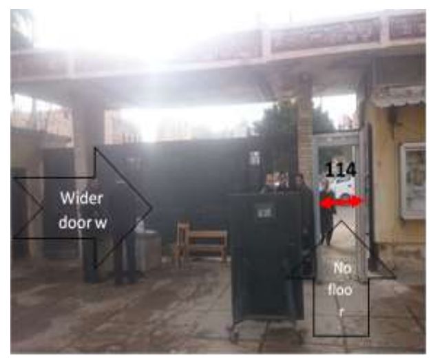
Figure 9: Entrance to the Roman Theater