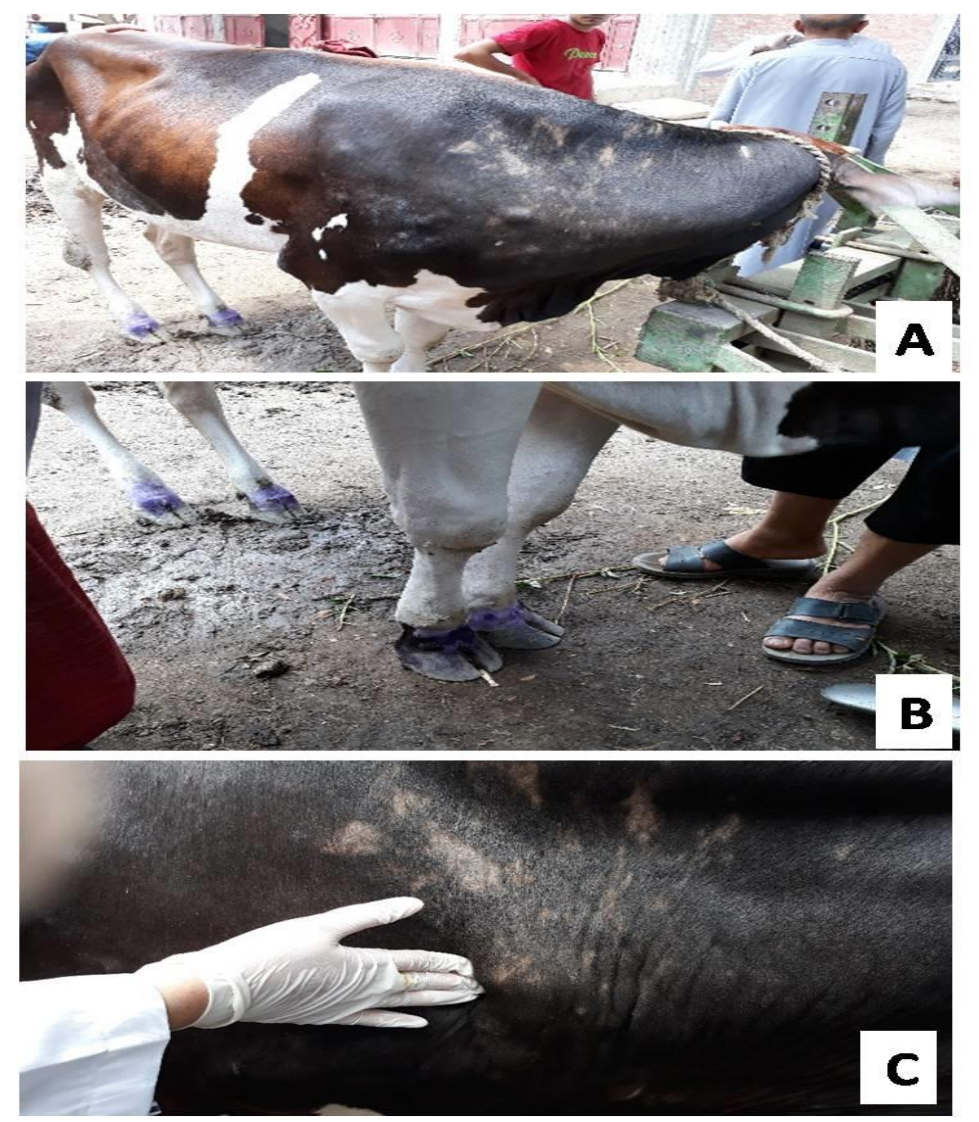
Figure (1): (A) Cutaneous skin nodules in a diseased cow with LSD. (B), Oedema in the dewlap and fore legs of a diseased cow with LSD. (C), Enlargement of prescapular lymph node in a diseased cow with LSD.

Values are means \pm SE. Significant differences in the values between control and diseased group were indicated by (*) at P<0.05.