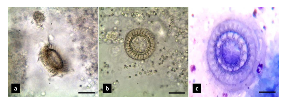
Fig. 1a, Fig. 1b: wet mount Trichodina spp . (X40) Fig. 1c: Giemsa stained smear of Trichodina spp . (X100)

Morphological descriptions of Trichodina spp. were recorded. Measurements of their body diameter, diameter of central adhesive disc and number of denticles were reported. Trichodina spp. are disc shaped and their body diameters were 76 \mu m (64- 88um). The diameter of their adhesive disc was 67.5 um (55-80 um), while the denticle ring diameter was 40 \mu m. The number of denticles was 28 (27-29). (Fig. 1a, b, c).