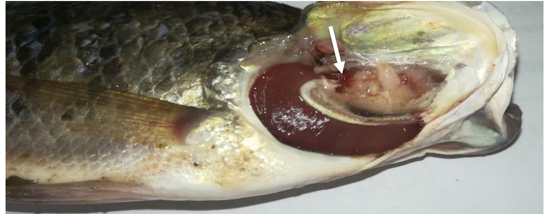
Plate (2): The fish gills were congested, and sometimes distorted (arrow).