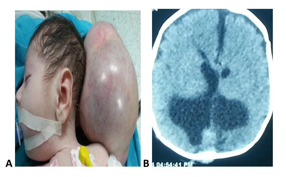
Figure 3: Large occipital encephalocele; A) lateral position, B) 3 months post-operative CT brain axial view with no hydrocephalus