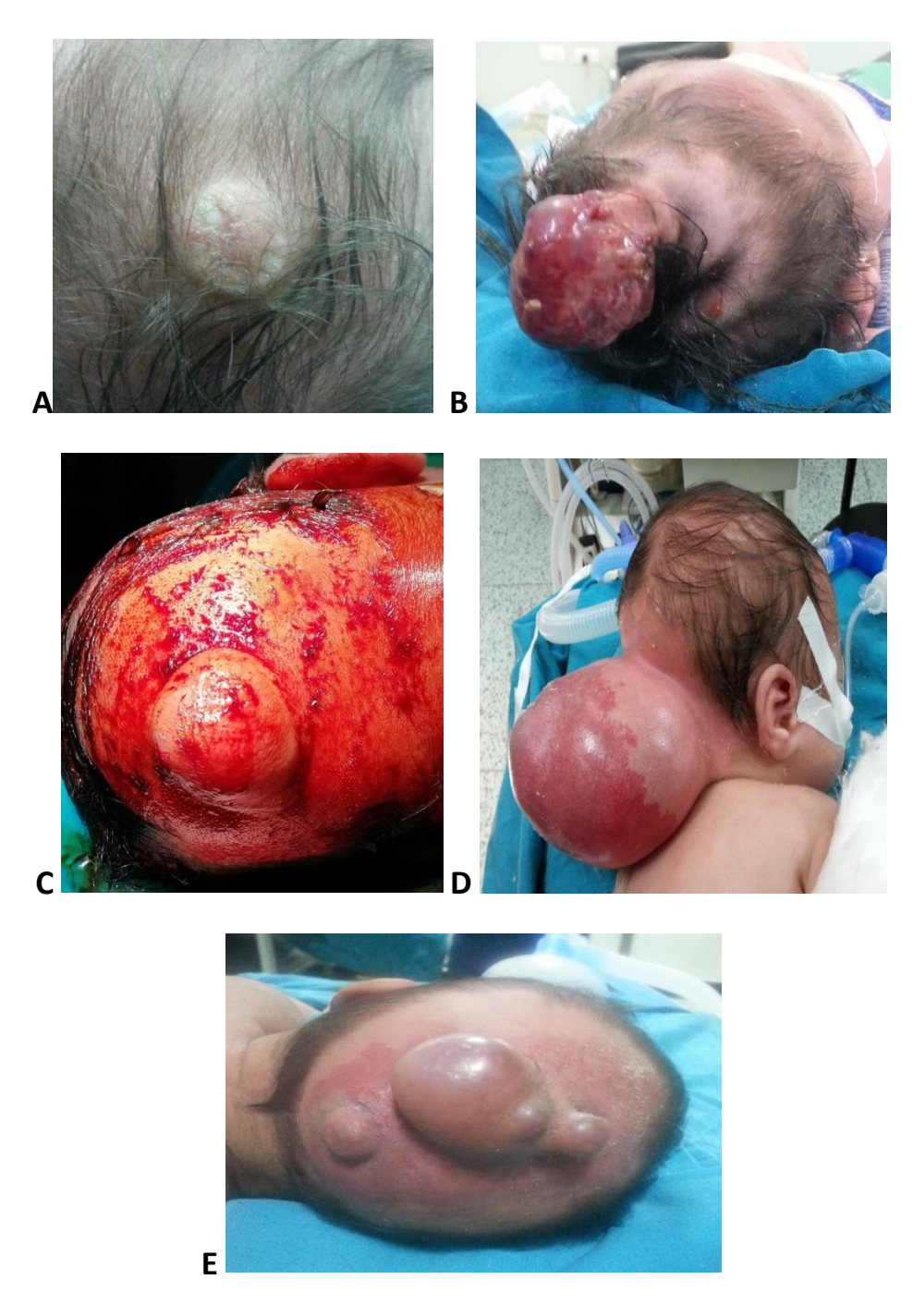
Figure 2: Types of encephaloceles; A) atretic, B) vault, C) occipital. D) occipito-cervical and E) double