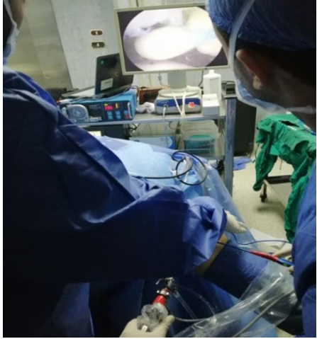
Figure 6: An arthroscopic vaper in the anteromedial portal of the right knee to cauterize the medial soft tissue with an assistant pushing the patella inferolateral.