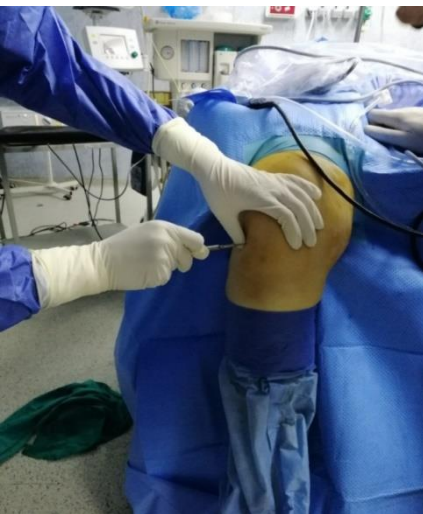
Figure 4: Beginning of the procedure with doing the anterolateral portal.

Benha medical journal, vol. 40, special issue (surgery), 2023