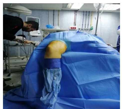
Figure 3: Position of the knee after sterilization and draping.