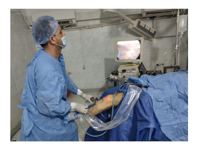
Figure 7: Switching scope to the anteromedial portal working from the lateral portal to cauterize the lateral soft tissue in the left knee.