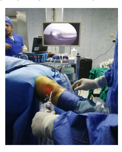
Figure 5: Probing the undersurface of patella revealing chondromalicia grade 1.