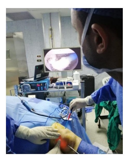
Figure 9: Cauterizing the superior soft tissue through the superomedial portal.

Figure 8: Spinal needle guides the superomedial portal to assure good access to the superior patella.