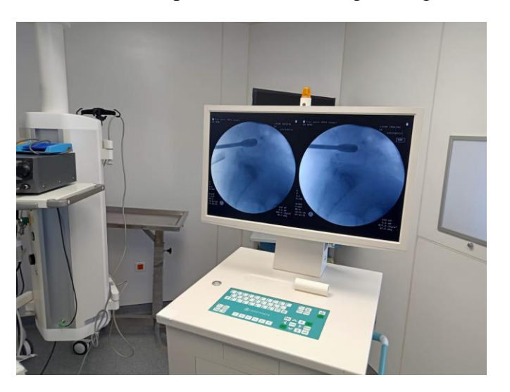
Fig 2: Under C-arm fluoroscopic supervision, the cage was introduced.

discectomy was done and grinding of the central and contralateral endplates was done with angled ring curettes.