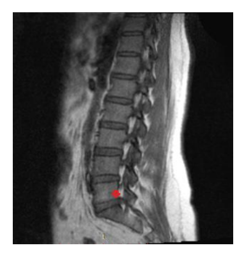
(A) Sagittal T1: L5-S1 disc herniation,L4-L5 disc bulge and Disc degenerative changes noted.