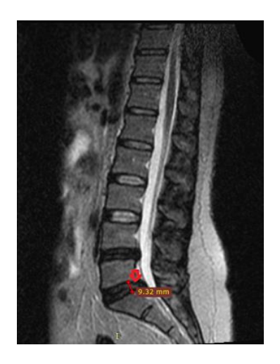
(B) Sagittal T2: L5-S1 disc herniation with moderate to sever spinal canal stenosis. Height of disc hereniation=9.32mm