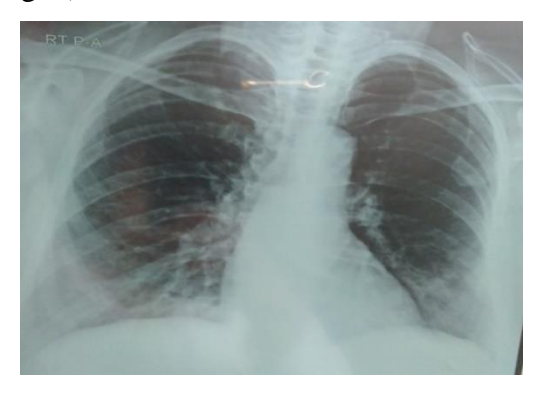
Figure (1): Plain x-ray chest (PA view), revealed accentuated bronchovascular marking on both sides & minimal reticulonodular opacity in both lung bases.

fields which plays a crucial diagnostic tool (Fig. 4).