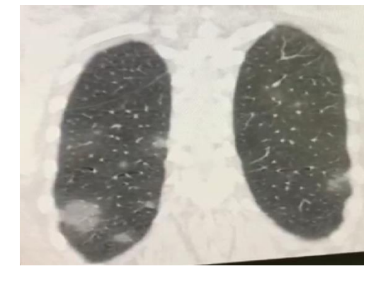
Figure (3): NCCT chest (coronal cut), revealed peripheral bilateral sub-pleural rounded ground glass opacities, more in lower lung zone.