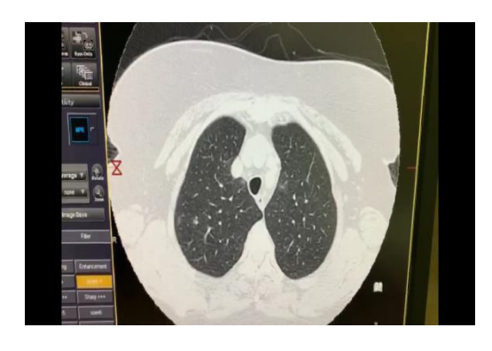
Figure (4): NCCT chest after 1 week of treatment (axial cut), revealed complete cure & clear both lung fields