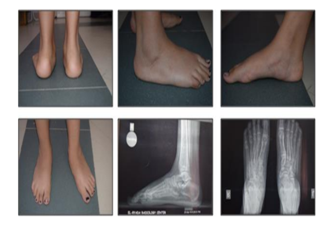
Fig. 4: Post operative photos