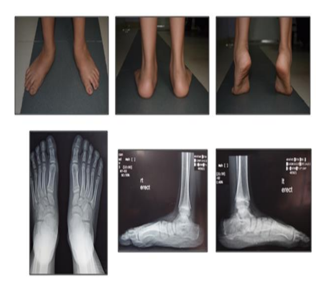
Fig. 3: Pre operative photos of a 15 y old female patient