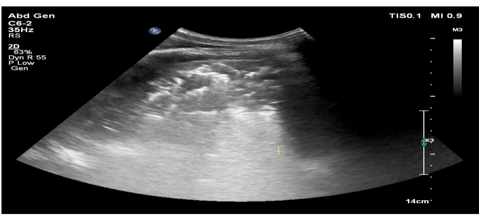
Figure 1: Air bronchogram

Statistical analysis was performed with IBM-SPSS software version 19(IBM inc., Armnok, NY, USA)