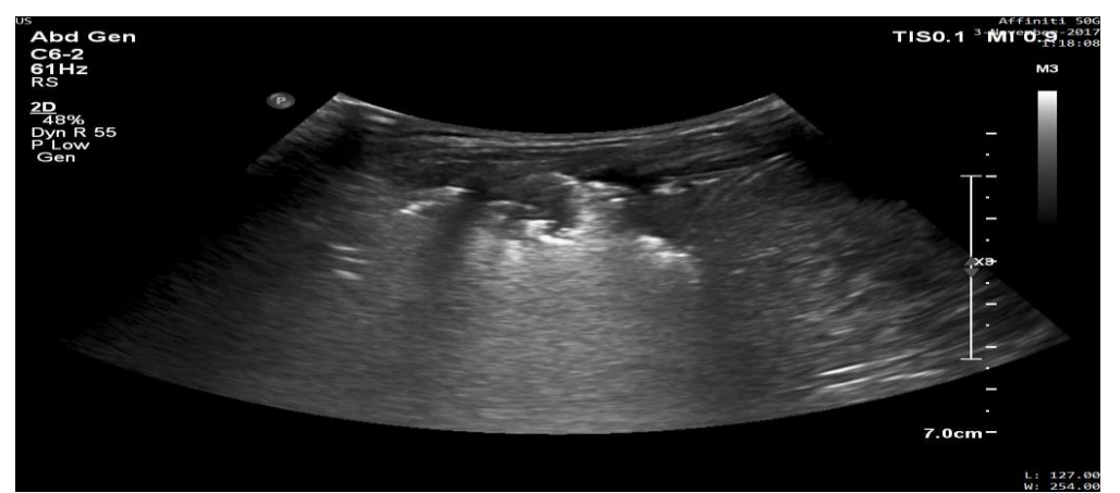
Figure 3: lung consolidation.