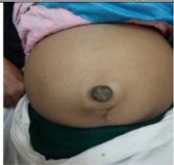
Fig (2): female patient 60 years with umbilical mass (Sister Josef nodules)