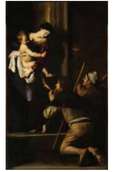
Figure 3 . Madonna of Loretto -- Caravaggio

Gracefully postured on the threshold of an entrance, Mary, attired in an overflowing gown, is depicted cradling the Child Christ while gazing at two pilgrims kneeling before them in an act of adoration. Both haloed by a golden circle, they seem to be accepting homage from the two devotees that have toiled in the weary pilgrimage. From the gesture of his