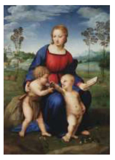
Figure 2 . Madonna of the Goldfinch -- Rafael

The Representation in the Madonna of the Goldfinch is a narrative one as the represented participants are engaged in certain actions. Mary, accompanied by the Christ Child and John the Baptist, is seen reading a book, most probably the Bible, interrupted only, as it were, by her maternal duties of caring for the two children. She is looking lovingly at the children. John, who is seated at her left, is seen extending forward a bird, a goldfinch, to Christ who in turn is patting its head. Christ is standing between her legs leaning back on her lap. The trio is surrounded by a naturalistic landscape.