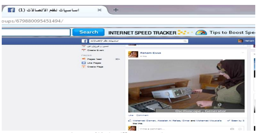
Figure (3) Oscilloscope, Generator