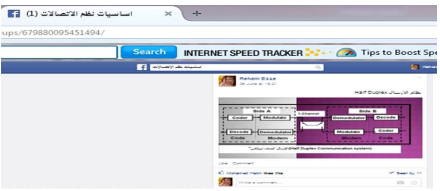
Figure (10) System of Sending Half Duplex Signal