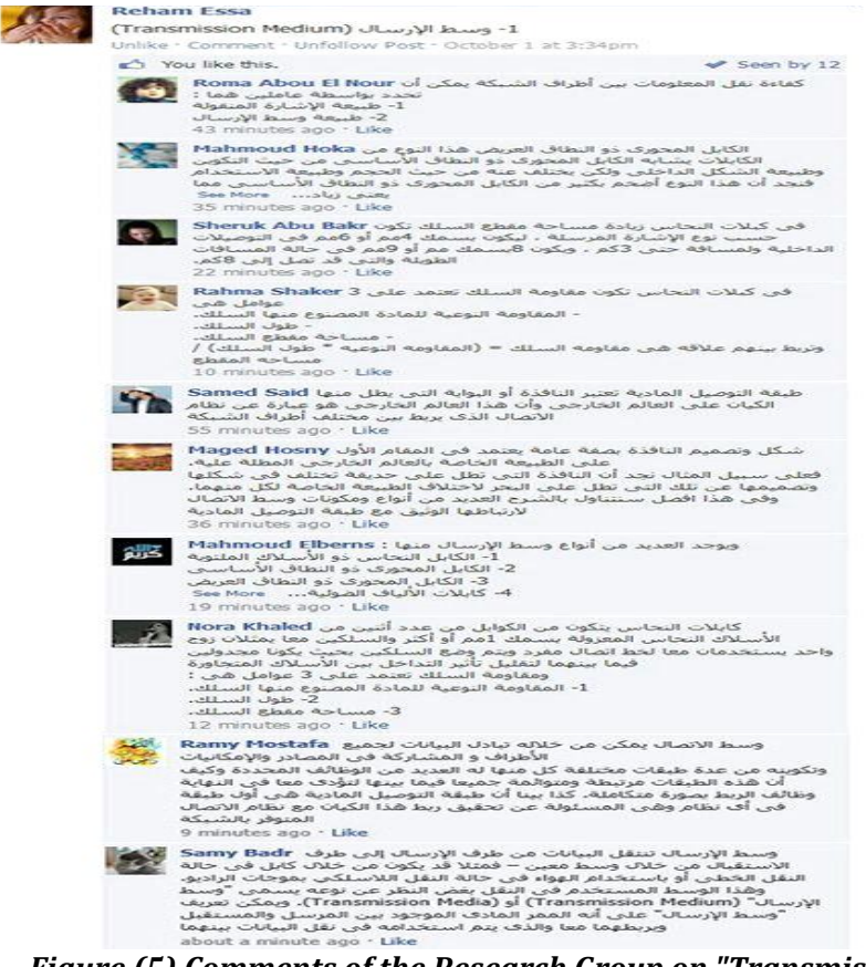
Figure (5) Comments of the Research Group on "Transmission Medium"

By clicking on transmission medium, comments appear as follows: