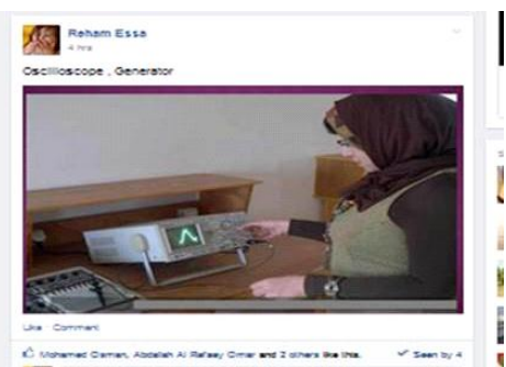
Figure (4) Warking with Oscilloscope , Generator

By clicking on transmission medium, comments appear as follows: