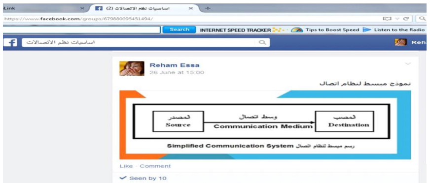
Figure (2) Sub-field of Communication System