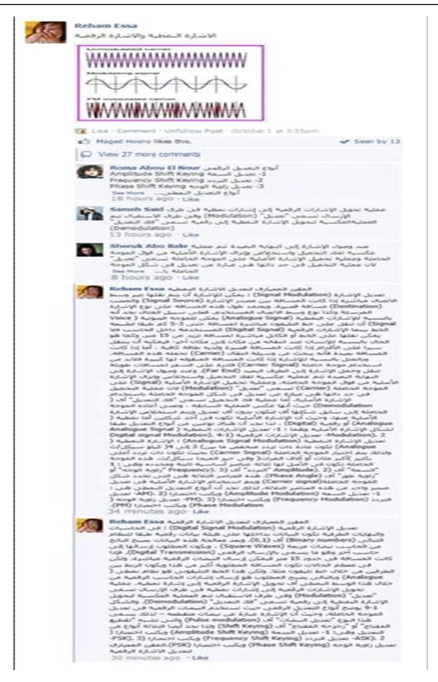
Figure (6) Comments of the Research Group on " Analog and Digital Signals"