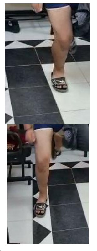
Fig. 8: Follow up