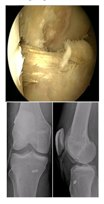
Fig. 5: Arthroscopic view showing ACL graft at the end of the operation and x-ray shows an All-Inside, GraftLink, Double-Tight-Rope ACLR technique.

Femoral Socket Creation and graft fixation (common in both groups):