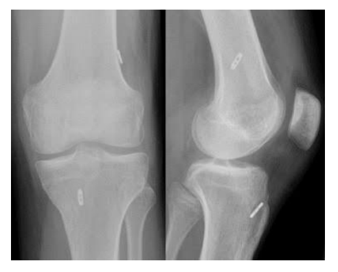
Fig. 13: Post-operative x-ray for ACL reconstruction with All-Inside technique

Patients stayed in the hospital for one or two nights, received some medications, did post-operative x-ray and start static quadriceps exercise.