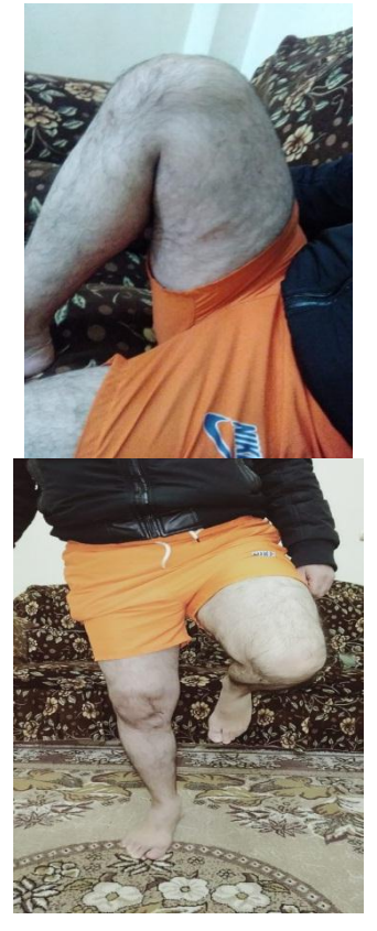
Fig. 14: Follow up