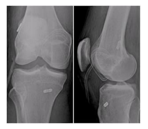
Fig. 7: Post-operative x-ray for ACL reconstruction with All-Inside technique

The femoral and tibial end buttons are visible on the postoperative x-ray for an all-inside ACL restoration. After receiving oral antibiotics and analgesics for a week, patients were discharged. Anticoagulation was provided either orally or intravenously to avoid DVT. Sutures were removed after 2 weeks and physiotherapy was started, following the rehabilitation program (Fowler Kennedy Sports Medicine program) for 6 months. (photos below)