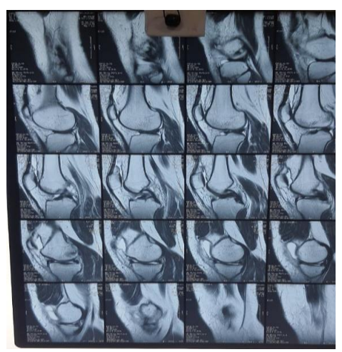
Fig. 15: MRI showing complete tear at ACL

Plain x-ray: Standing AP and lateral X-rays of the affected knee looks Normal x-ray. MRI: It shows loss of normal contour and pattern of the ACL.