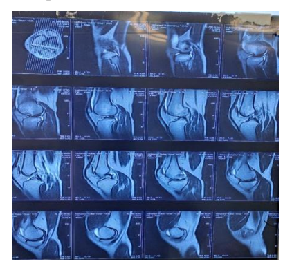
Fig. 9: MRI showing complete tear at ACL

Plain x-ray: Standing AP and lateral X-rays of the affected knee looks Normal x-ray. MRI: We found disruption at ACL fibers of the affected knee joint.