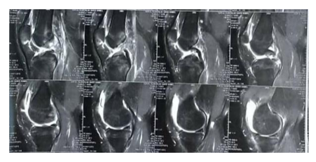
Fig. 6: MRI showing complete tear at ACL

Plain x-ray: Standing AP and lateral X-rays of the affected knee looks Normal x-ray. MRI: We can't visualize ACL fibers as a result of ACL rupture.