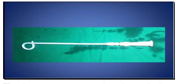
Fig. 1: Percutaneous External Drainage pigtail catheter

Percutaneous External Biliary Drainage : was done to drain the obstructed biliary system. The used catheters were: Pigtail catheters 8-12 F. and Femoral catheter 6-8 F.