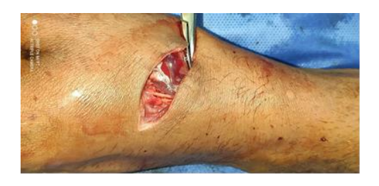
Fig 4: Silicon sheet wrapping the repaired tendon.

Post-operative therapy: Make sure the dressing, splint, and bandage are not so tight to avoid any distal ischemia.