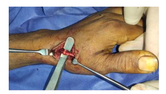
Fig 2: After repair.