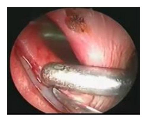
Fig.2: Flap elevation on the left side.

Fig.1: Infiltration of the nasal septum using 1:200,000 adrenaline in saline solution. (NS= Nasal septum. MT= Middle turbinate. IT= Inferior turbinate).