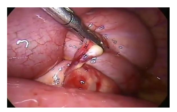
Fig. 2: Intestinal obstruction due to Adhesive band on appendicular stamp "during laparoscopic adheiolysis".