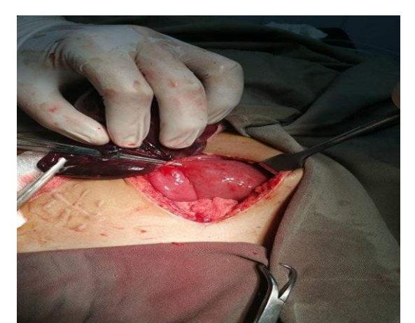
Fig. 6: Adhesive Intestinal obstruction due to Adhesive band post appendectomy with gangrenous part of small bowel "ilium Adhesive Intestinal.