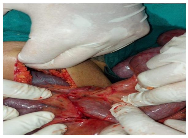
Fig. 8: Adhesive Intestinal obstruction due to multiple Adhesive bands.