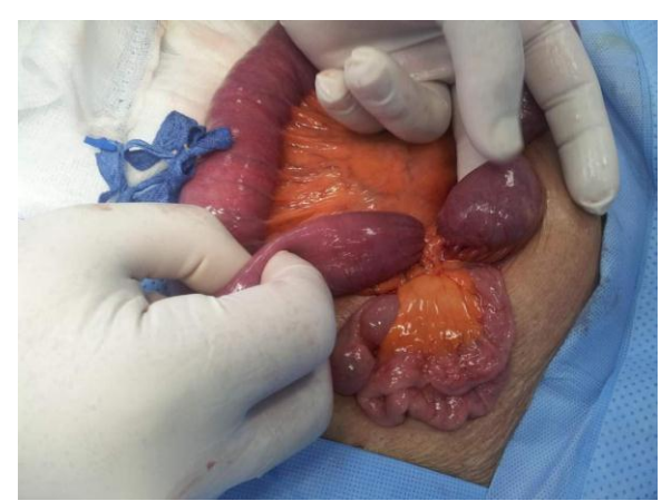
Fig. 7: Obstruction in femal patient due to Adhesive band post appendectomy with dilated part proximal to band and collapsed part distal to the band.