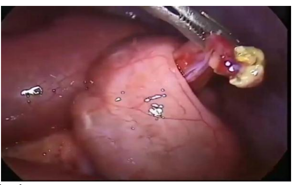
Fig. 4: After releasing the band.

Fig. 3: During release of the band by scissors.