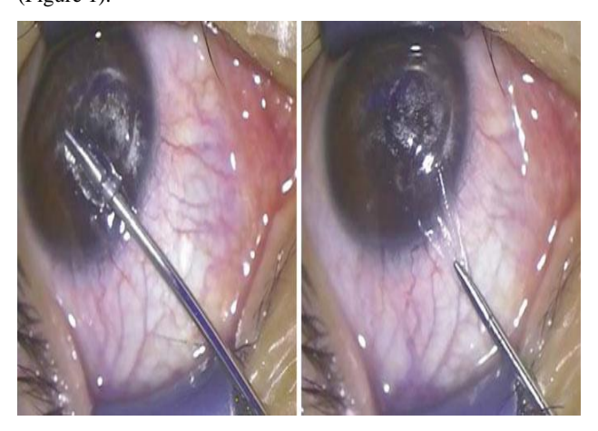
Fig. 1: extraction of the lenticule through small incision

SMILE Procedures: The VisuMax femtosecond laser system (Carl Zeiss Meditec AG, Germany) was employed to design the corneal stromal lenticule, the laser pulse frequency was 500 kHz and pulse energy ranged from 130 to 160 nJ. The cap thickness designed to be between 110 and 120 µm, the diameter of the lenticule varied from 6.0 to 7.0 mm, and the corneal cap diameter designed to be 1.0 mm larger than the lenticule. A blunt spatula was used to first the front surface of the lenticule and then it's back surface. After that the surgeon manually brought out the lenticule through a tiny opening (Figure 1).