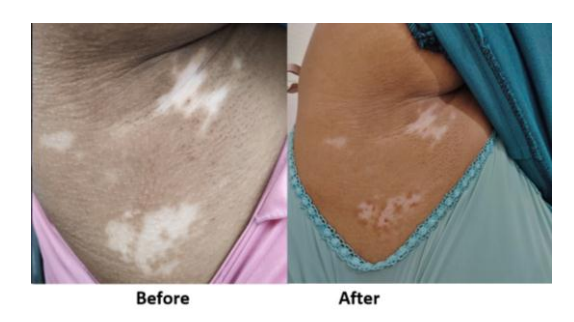
Fig 4: A 28-year-old female with axillary vitiligo before and after treatment showing improvement in patch A after 3 months of treatment. (Lower one 50 %) and patch B (upperone25%) (Patch B using (Intralesional Triamcinolone Acetonide).