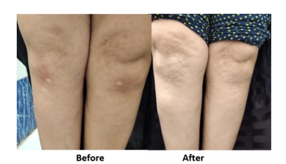
Fig 3: A 40-year-old female with knee vitiligo. Before and after treatment showing improvement in patch A (RT one100 %) and in patch B (LT one100 %) after 3 months of treatment. patch A using (intraregional methotrexate). (Patch B using (Intralesional Triamcinolone Acetonide).