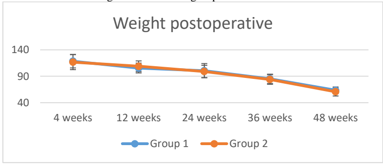
Fig. 1: Weight post operative among the two studied groups.