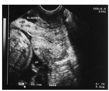
Fig. 2: Transvaginal ultrasound scan showing a short cervix measuring 28.1mm in length. This case delivered preterm.