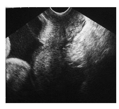
Fig. 4: Transvaginal ultrasound scan showing a markedly shortened cervix with funneling.