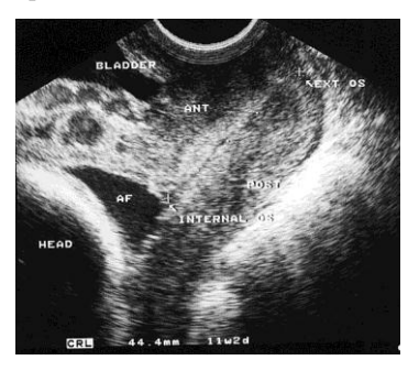
Fig. 3: Transvaginal ultrasound scan showing a relatively long cervix measuring 44.4mm in length. This case delivered at term.