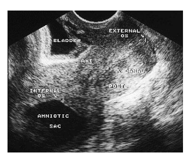
Fig. 1: Transvaginal ultrasound scan showing landmarks found for cervical length measurement with an optimized plane for scanning.

Follow-up till delivery: patients were followed up till delivery and the gestational age at which labour occurred was recorded. Spontaneous preterm birth was defined as the onset of labour before 37 completed weeks.