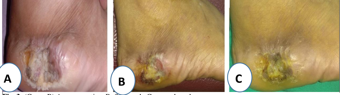
Fig. 3: (Group B) A: preoperative, B: first week, C: second week.