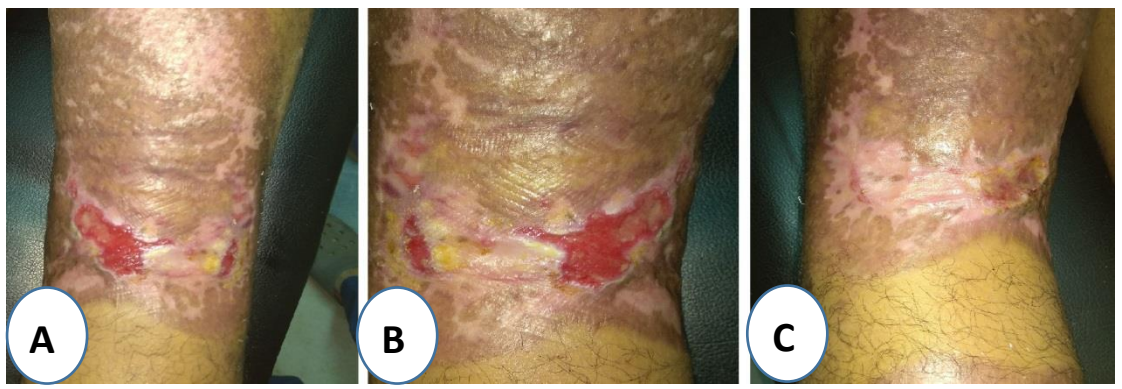
Fig. 4: (Group B) A: preoperative, B: first week, C: second week.