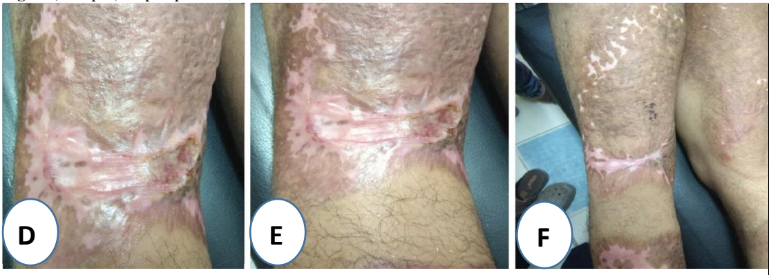
Fig. 4: (Group B) D: 4th week, E: 6th week, F: 8<sup>th</sup> week.