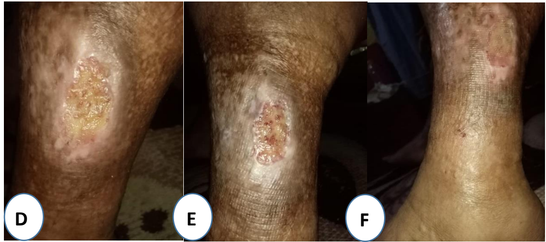
Fig. 1: (Group A) D: 4th week, E: 6th week, F: 8<sup>th</sup> week.