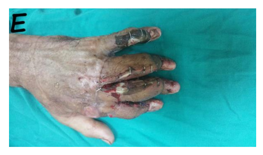
Fig.2: A: male patient 45 years old with post traumatic soft tissue defects at the dorsum of medial 4 fingers. B: ALT flap marking at the contralateral thigh. C: suprafascial harvesting and primary thinning of contralateral ALT flap. D: in setting of the flap over the defect. E: 3 weeks later post operative view after separation of the flap to reconstruct the finger.