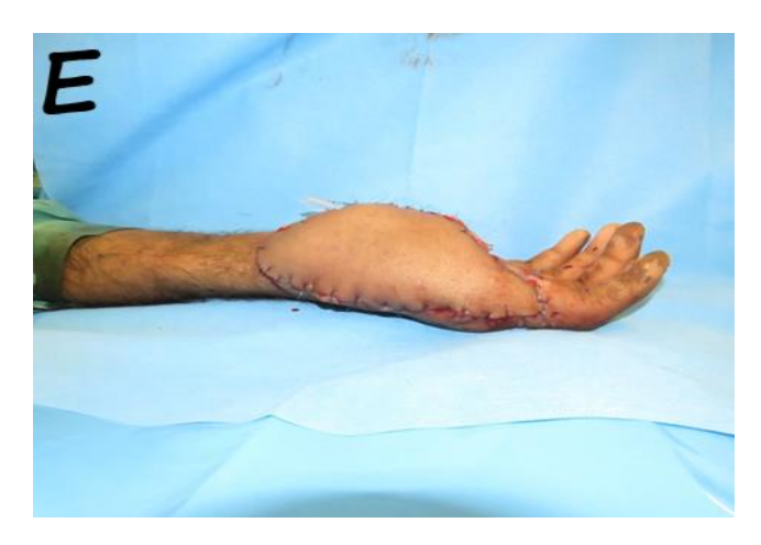
Fig. 1: A: male patient 24 years old with post traumatic amputation of rt thumb. B: ALT flap marking. C sub fascial harvesting and primary thinning of contralateral ALT flap. D: Preparation of recipient vessels. E: post operative view after coverage of the raw area.