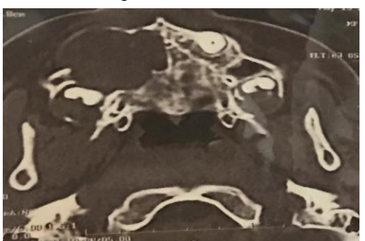
Fig. 2: Axial CT scan of RT Dentigerous cyst

Diagnosis of ODS is dependent on a comprehensive investigation. Assessment of patient symptoms {according to the criteria of the American Academy of Otolaryngology-Head and Neck Surgery (AAO-HNS), diagnosis of rhinosinusitis includes at minimum 2 major factors or at minimum 1 major and 2 minor factors of a set of clinical signs and symptoms}, dental history, paranasal sinus CT or cone-beam CT (figure 2).