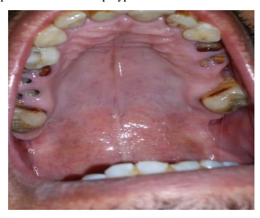
Fig. 1: Showing upper right and left remaining roots due to severe dental caries and bad oral hygiene

The participants in the research were adults over 18 years of age who had sinusitis of dental orange (figure 1). The exclusion criteria were for those who had sinusitis other than dental origin such as pansinusitis or nasal polyps.