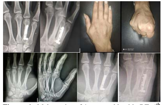
Figure 6: Male patient 24 years old with RT 4<sup>th</sup> MCB fracture. Images show preoperative facture, k-wire fixation, after healing and range of motion.