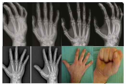
Figure 5: Male patient 20 yrs old with RT 5^{\text{th}} MCB fracture. Images show preoperative facture, k-wire fixation, after healing and range of motion.

Patients were randomized in blocks of three to receive either K wire fixation or mini-plate fixation. Randomization, data entry, storage, and processing were performed using a web-based electronic data capture (EDC) system.