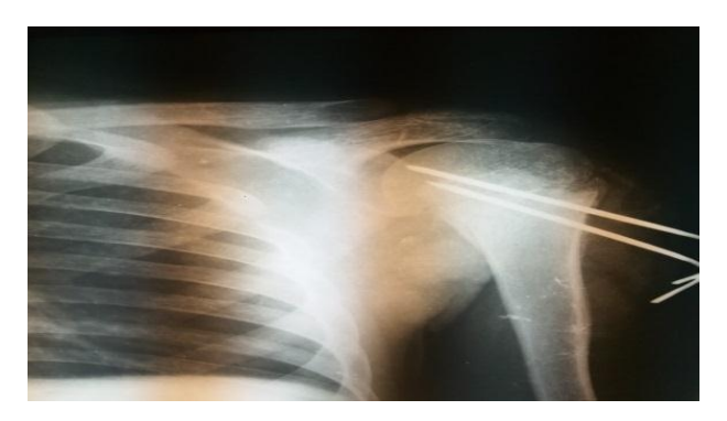
Fig. 4: After 4 weeks

Male patient 14yrs old presented with fracture of left proximal humerus after direct trauma to the shoulder