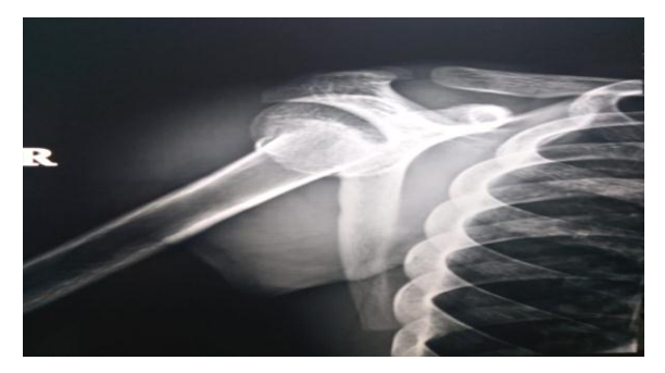
Fig. 1: Pre-intervention X- ray films.

Male patient 11 yrs. old presented by displaced surgical neck fractures after fall onto an outstretched hand