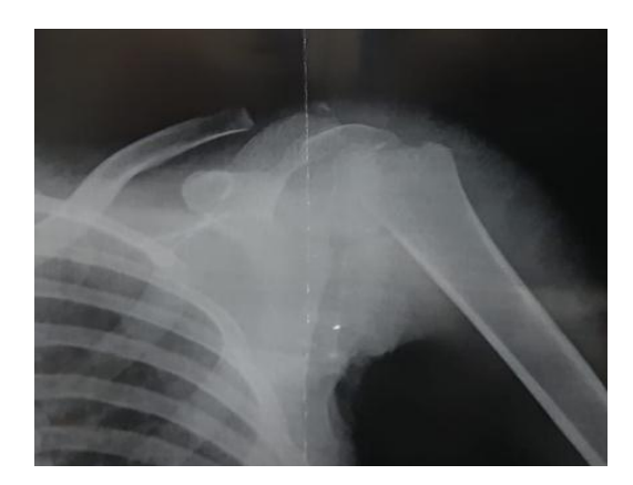
Fig. 5: Pre-operative x-ray

Male patient 14yrs old presented with fracture of left proximal humerus after direct trauma to the shoulder