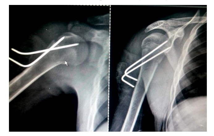
Fig. 3: Post-operative X-ray film