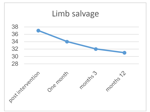
Fig 3: Limb salvage

Limb salvage: Limb salvage was defined as the absence of major amputations. Amputations of a toe, ray, or trans metatarsal were considered minor amputations.