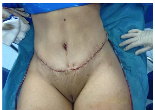
Fig. 10: Immediate post-operative

Then we final revision of hemostasisis before stay sutures to distribute tension. 2 drains put laterally then is skin closed by suturing of scarpa's fascia, which is important layer and must be closed under maximum tension to reliefe the overlying layers, it is closed with 0 vicryl suture. Upper flap is advanced medially to eliminate any dog ears then deep dermal 2/0 vicryl sutures is put before final sub cuticular 4/0 prolene sutures. Then we dress the wound and dress the pressure bandage.