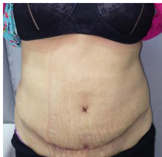
Fig. 12: Pre and post-operative view of liposuction assisted full abdominoplasty