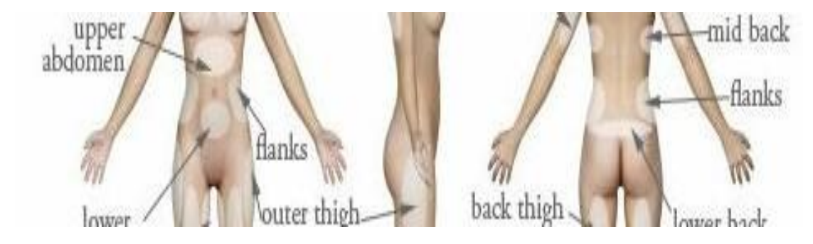
Fig. 2: All areas for liposuction are marked this includes; the entire central abdomen, flanks, and hip rolls.

Lateral part of the incision is marked and agreed by the patient then the proposed upper incision is identified and marked by pinch test.