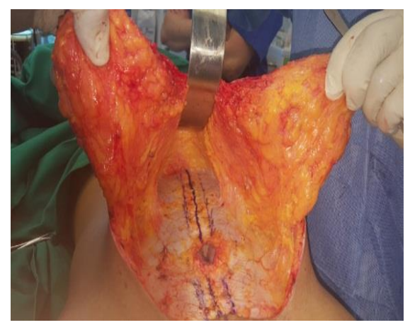
Fig. 7 Wide rectus abdominal muscle placation

It is forbidden to detach the the flap beyond costal margin to preserve its vascularity, but gentle cannula dissection is allowed to get more flap mobility and eliminate tissue ridge without affecting blood supply. This keeps the fibrous septa which contain vascular perforators, then we simulates linea alba of the youthful abdomen by traction sutures with Vicryl 2/0 in the midline. (Figure 9)