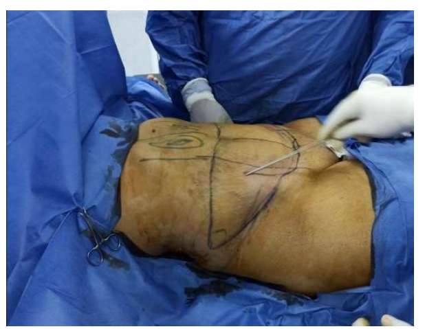
Fig. 3: Traditional liposuction with 4 mm diameter cannulas

loose areolar tissue between abdominal wall and skin flap to make easier dissection with 3mm infiltration cannula till achieving tissue turgor. 20 minutes later the liposuction of deep plane started with 4 mm cannula, then final refining with 3mm cannula