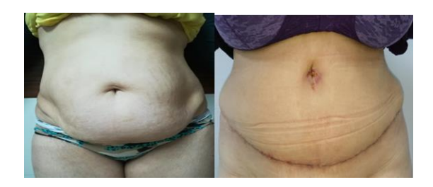
Fig. 11: Pre and post-operative view of liposuction assisted extended abdominoplasty

The weight of excised skin and subcutaneous fat in the 10 cases under group (A) ranged from 2500 to 4000gm. with a mean of 3.070 kg. Operative time was ranged from 3.5 to 5 hours with a mean of 4 hours. The volume of Aspirate in 10 cases ranged from 3000 to 4000 cm with mean of 3.6 liters each case. The total drain output in the 10 cases under group (A) ranged from 600 to 1500 ml. with a mean of 885 ml per case. The days needed for drains removal in the 10 cases under this group ranged from 3 to 7 days with a mean of 4.8 days per case. The days of hospital stays in the 10 cases under this group ranged from 2 to7days with a mean of 3.8 days per case. Bad patient satisfaction occurred in one patient showed recurrent protrusion of ant. Abdominal wall which needed revision.