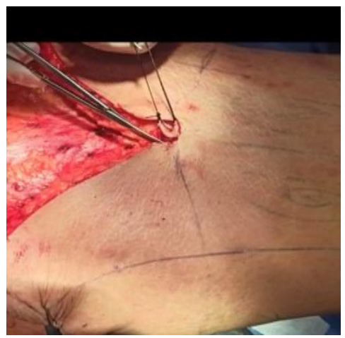
Fig. 6: umblicus seperation