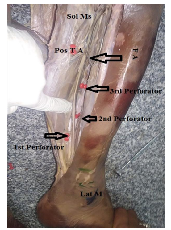
Figure (5): Showing posterior aspect of lower limb of cadaver with soleus muscle perforators from lateral malleus to horizontal line crossing tibial tuberosity. Posterior tibial artery perforators located at 8 cm , 11cm , 17 cm and 21 cm respectively from lateral malleus. (Lat M = lateral malleolus , Post T A = Posterior tibial Artery, Sol Ms= Solues muscle, FA= fibular (peroneal) artery ).