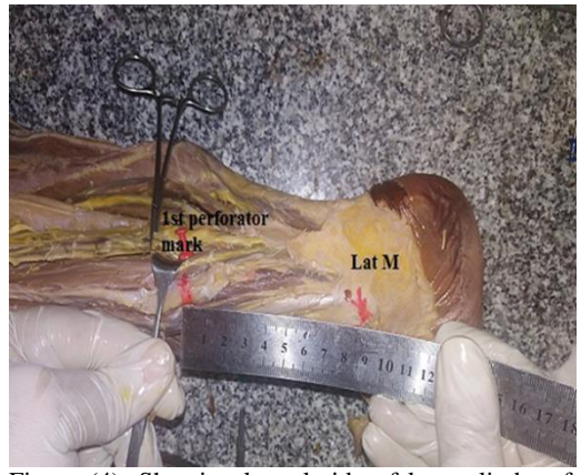
Figure (4): Showing lateral side of lower limbs of cadaver with lateral malleolus mark and 1st perforator of posterior Tibial artery to soleus muscle 9cm above lateral mallus (1st perforator Mark = 1st perforator artery of posterior tibial artery , Lat M = lateral Malleolus )