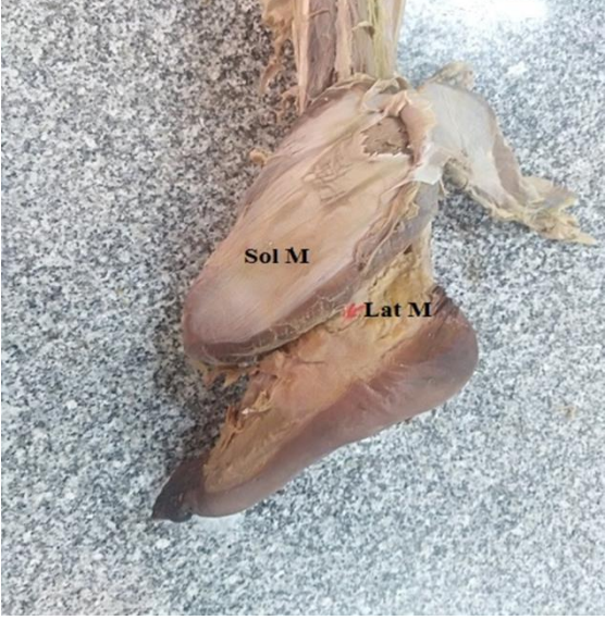
Figure (6): Showing lateral aspect of lower limb of cadaver with soleus muscle flap reach to the dorsum of foot according to the 1st perforator of posterior tibial artery from lateral mallus without kinked vessels( Sol M = Solues muscle, Lat M = lateral mallus ).