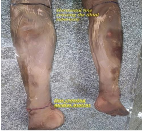
Figure (1): Showing Posterior view of right leg with a longitudinal midline incisional from horizontal line crossing tibial tuberosity and line crossing medial and lateral malleoli.

Data were analyzed using IBM© SPSS© Statistics version 23 (IBM© Corp., Armonk, NY, USA).Continuous numerical variables were presented as mean and standard deviation (SD).