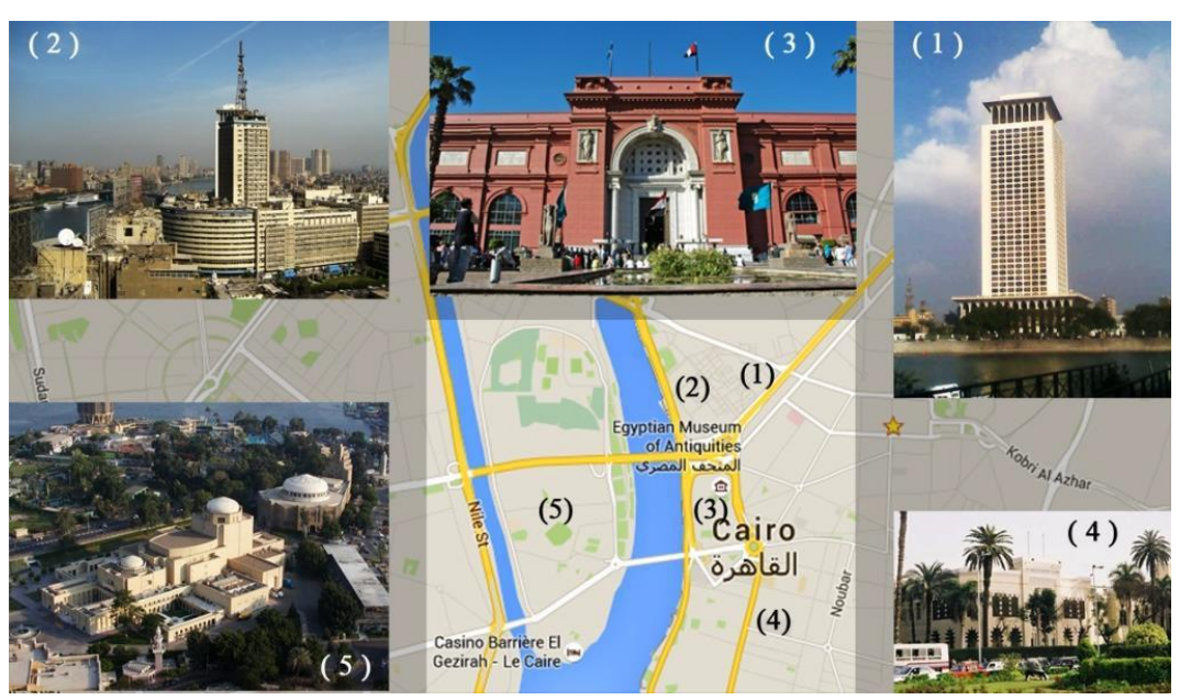
Figure (1-8) Major landmarks of AL-Zamalek and Syalt EL-Roda Islands; The Egyptian Muesum, Media building, Opera and Cairo University campus highlight the major points of cultural corridor. Cairo Tower, famous hotels and Nile parks are a core part of the recreational corridor along River Nile.

Also, the Island is well known for having fashionable residential districts with green nodes and a lot of private schools. Accordingly, this study suggests a recreational center that links the River's landmarks, green spaces, social clubs, cycle way, commercial malls and other recreational activities within residential areas. These kinds of activities will increase the connectivity between recreational elements and improve the quality of vegetation, increase active recreation and moderate the microclimate to reduce air temperature via luxuriantly vegetated routes. Therefore, the scope for connectivity and integration suggests a possibility to establish a recreational center in the eastern bank of AL-Zamalek Island. This proposed recreational center could include open spaces, green areas, social club, hotels, cycle way, green axes and a commercial mall, and their functions integrate with the existing recreational activities that surrounding this center (Figure 1-8).