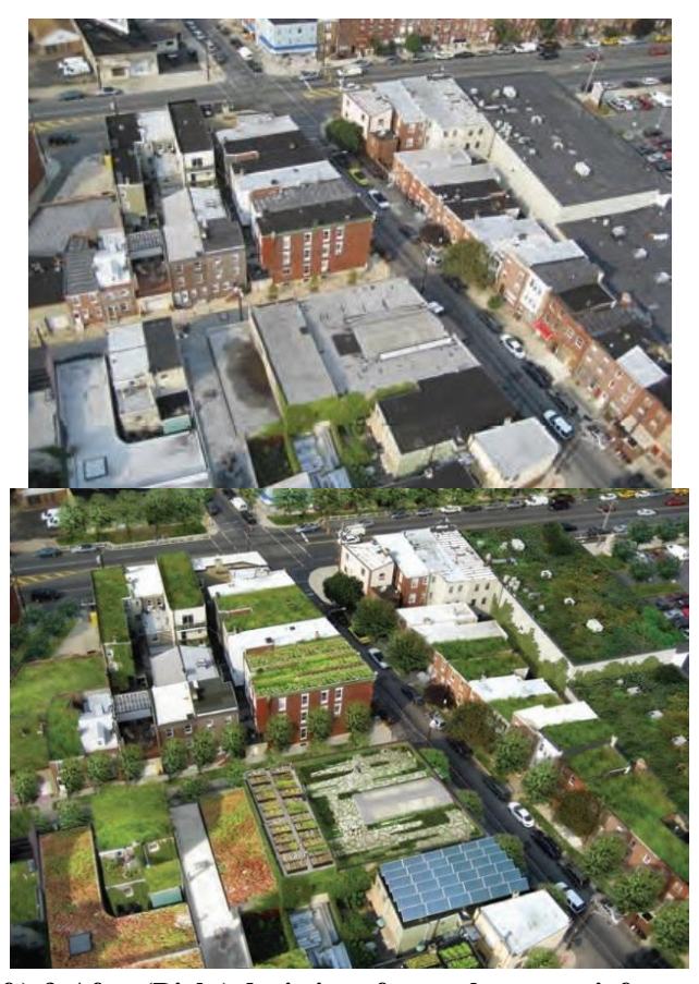
Figure (1-1) Before (Left) & After (Right) depiction of ways that green infrastructure might transform part of South Philadelphia.

Utilizing a combination of green and gray infrastructure, hybrid approaches, may provide an optimum solution to shocks and improve the overall resilience of an organization. For example, gray components may support the growth phase of green infrastructure projects, or vice versa.