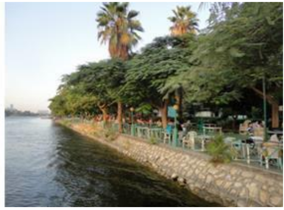
(Fig. 1-4) Different recreational activities within social clubs in Syalt EL-Roda Bank.