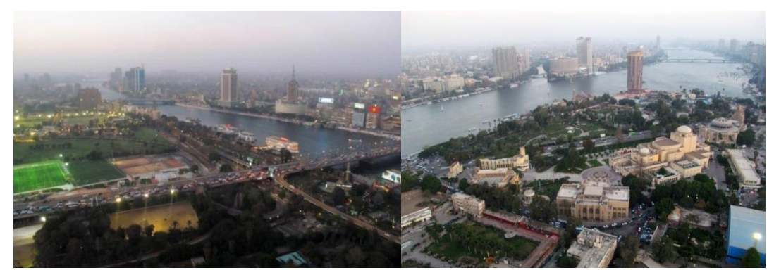
Figure (1-7) Recreational functions in AL-Zamalek Island and its banks. Left: green spaces in Gezira sporting club. Right: Opera cultural centre and the public Nile Park.

most extensive green space designed & established in modern Cairo, alongside other prestigious landmarks, such as Cairo opera house & the Cairo tower (Fig. 1-7).