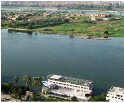
(Fig. 1-9) The agricultural lands of EL-Dahab Island based on an irrigation system directly from River Nile.

The western side of the River Nile, which fronts onto these Islands, has mixed uses. The dominant use is residential and it is supported by different recreational functions from small gardens, open spaces and social clubs. Also, commercial and governmental buildings spread along the River bank. These functions help and support the multiple functions on these three islands by connecting visually and functionally via the Nile. Additionally, the eastern river bank from the island includes Ather EL-Naby port that is the main access to the island and which has an industry zone and some storage areas for building materials.