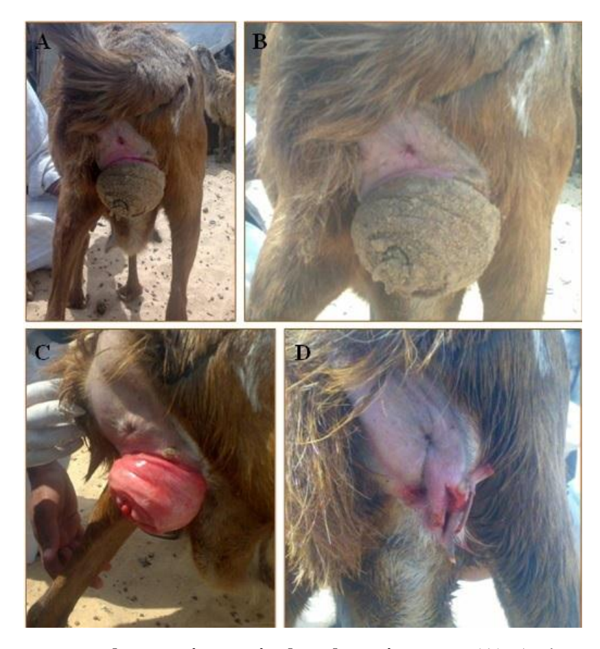
Fig. 1. Prepartum complete cervico-vaginal prolapse in a ewe. (A) A photograph showing a contaminated cervico-vaginal prolapsed mass with a sandy attached layer. (B) A photograph showing a closer view of the prolapsed part. (C) A photograph showing the prolapsed part after being carefully washed, and cleaned before replacement. (D) A photograph showing the vulvar lips after replacement and suturing used to prevent the reoccurrence. Note: The retention suture was removed before lambing.