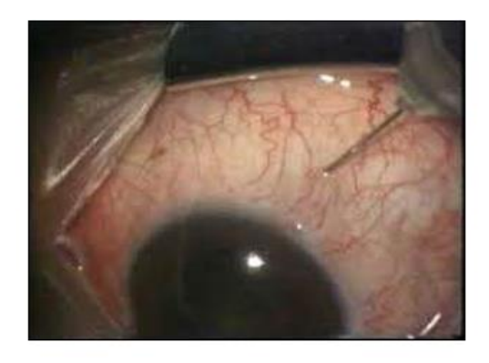
Figure 1: Intravitreal injection in superior temporal quadrant.