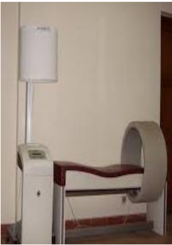
Figure 1. Electromagnetic unit ASA magnetic field. Adapted from (Mahmoud et al., 2015)

intensity varies according to the type of solenoid. The appliance, motorized bed, and solenoids are built to operate correctly at room temperature between 0°C and 40°C and relative humidity from 30% to 75% (Elsisi et al., 2015).