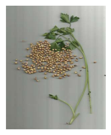
Fig. 1: Coriander seeds and plants cultivated in Libya.

After 21 days, data were recorded including seeds germination and all growth parameters of all treatments of coriander plants (Figure 2).