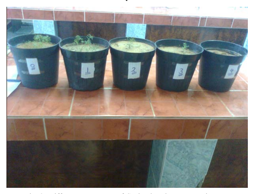
Fig. 2: Different treatments of Coriander plants grown in pots.