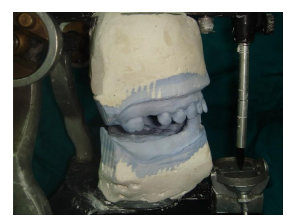
Figure 2: mounting upper and lower cast on articulator

arches was taken in a sterile well-fitting stock using irreversible hydrocolloid tray impression material (Cavex Holland B.V., P.O Box 852-2006 RW Harlem, Holland) and poured to obtain the diagnostic casts (Type III dental stone ) The cast was duplicated to produce two working casts for the acrylic and the flexible partial dentures to ensure the exact dimension for both partial dentures. self-cured acrylic resin (Peka tray Acrostone . England) special tray was constructed and a final impression was made using rubber base impression material (Gollene Speedex Dental Vertrieb G murrbtt Konster. Germany), boxed and poured in dental stone. Occlusion blocks were constructed on the master cast. mount the upper cast on a semi-adjustable articulator (Whip Mix # 8500; Louisville, KY.U.S.A) the mandibular cast was mounted according to a centric relation record obtained from the patient using the check bite technique (Figure 2).