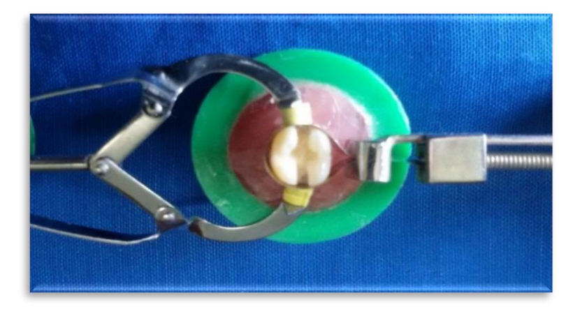
Figure 2: Tofflemire matrix band was contoured and placed around the teeth and held firmly by ivory No. 1 holder and rubber stoppers at the proximal aspects of the teeth.

Marginal adaptation of any restorative material to the cavity margins can be measured by either microleakage and dye penetration test or marginal adaptation measurements. Achieving a quantitative analysis of the marginal adaptation in the form of continuity, presence of irregularities and gaps with estimating the width of gaps is chosen for the present study rather than qualitative measuring of microleakage.