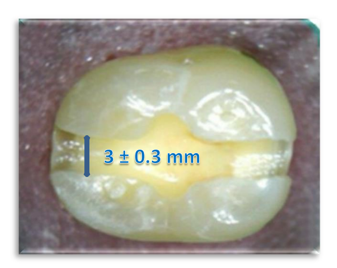
Figure 1: MOD cavity prepared in lower molar. The cavity width is (3 \pm 0.3 \text{ mm}) and depth is (4 \pm 0.3 \text{ mm}) without proximal boxes.

Table (1): Restorative materials specification and composition