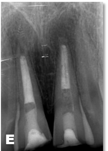
figure (2): A- perioperative radiograph showing periapical pathosis and immature upper central incisors. B- The baseline radiograph taken after the MTA placement. C- 6 month follow up radiograph . D- 12 month follow up radiograph and E-18 month follow up radiograph.