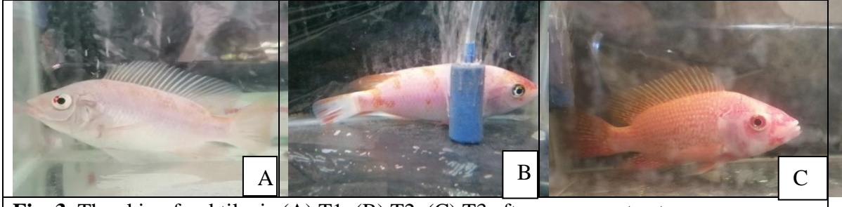
Fig. 3. The skin of red tilapia (A) T1, (B) T2, (C) T3 after exposure to stressors.

There was an increase in the values of the skin colour of the fish in all treatments. Increasing values means that the fish intensifies its skin colour as shown in the colour chart ( Fig. 3 ) that was used in the study. Although the skin colour of fish increased, significant differences were only observed on days 2, 3, 4, 6, 9, 11, 12 and 14. Significantly higher values were observed in blue LED and red LED compared to those in the control treatment on days 2, 6, 9, 12, 14, while on days 3, 4 and 11 only values in red LED were higher compared to those in the control. This indicates that the fish were stressed due to their exposure to LED ( Table 4 ).