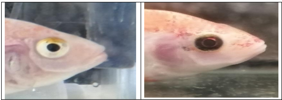
Fig. 2. Eye colour pattern of red tilapia before (A) and after (B) exposure to the red LED.

Eye colour pattern (ECP) in all treatments had the same values (1) before the introduction of stressors. However, the ECP of the fish increased immediately after a day of exposure to LED. The ECP of the fish in the control group also increased but not as much as the increase in the LED treatments. Significantly darker mean ECP values were also observed in Red LED treatment compared to those in the control treatment (Fig. 2), from day 1 up to day 15 of the experiment, while significantly darker ECP values were observed in the Blue LED treatment starting day 2 up to day 15, except day 6 (Table 2).