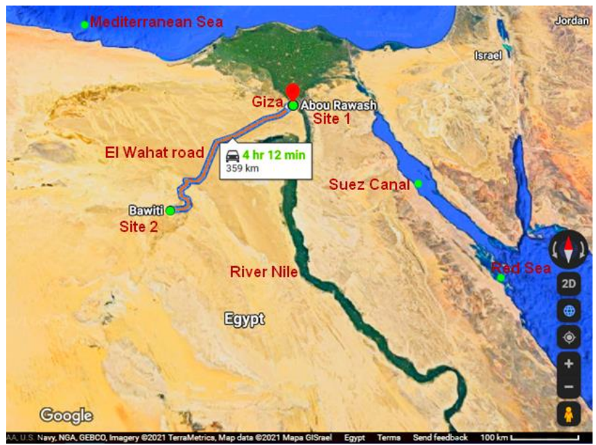
Fig. 1: Map showing the two studied regions, site 1 (Abu Rawash) and site 2 (El-Bawiti).

(Reuss, 1833) a species of toad in the family: Bufonidae, Order: Anura was selected as study animals.