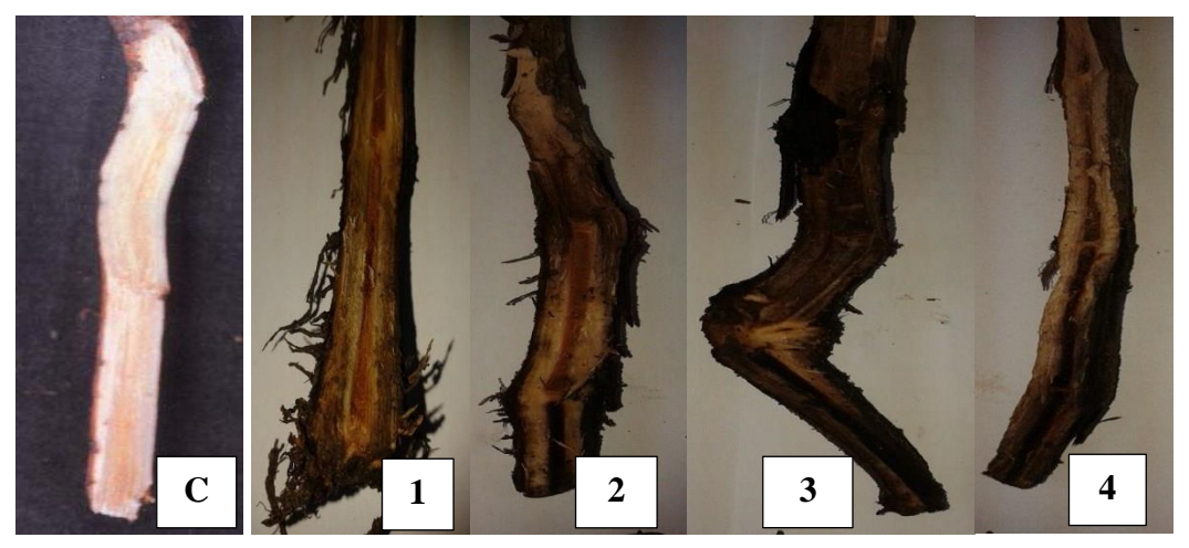
Fig. 3. Root-rot discoloration and maceration of grapevine root system of Cv. crimson, by Fusarium oxysporum (1), R. solani (2), Macrophomina phaseolina (3) and B. theobromae(4) compeer with control (c).