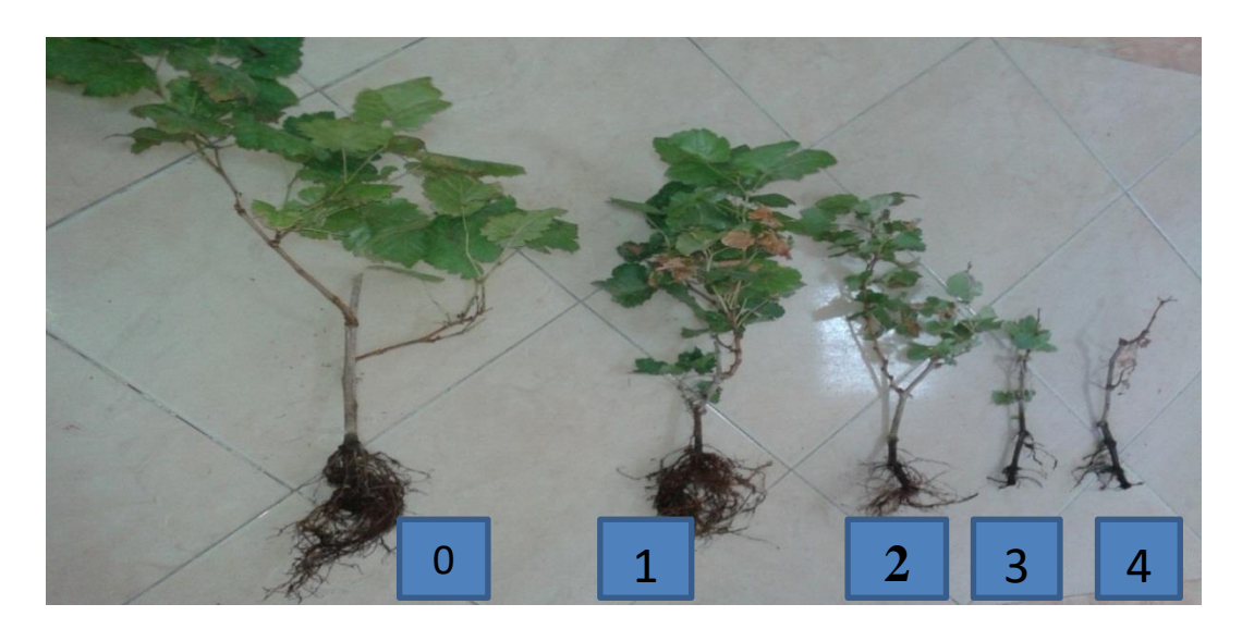
Fig. 1. Different root-rot disease severity of shoot and root of grapevine Cv. crimson, under artificial infested soil by soil borne fungi.