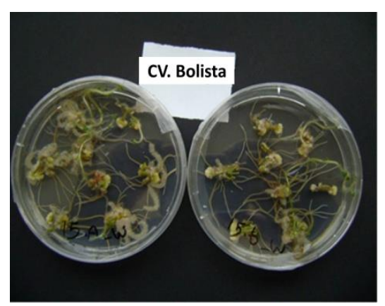
Fig. 1. Sprouting and rooting from single node explants.

% of rooted explants= no rooted explant/total no. of explant x100