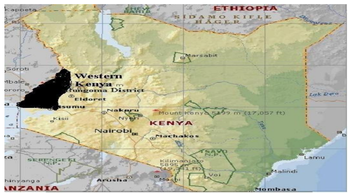
Fig. 1: Map of Kenya showing the location of the study area.

The research was carried out in Trans-Nzoia and West Pokot counties at an altitude of 1,900 meters, a latitude of 1°1'8.72"N, and a longitude of 35°0'8.3"E and altitude of 1906 meters, latitude1.59244 and longitude 35.28536 respectively (Fig. 1). The main activity in the area is crop farming and livestock husbandry.