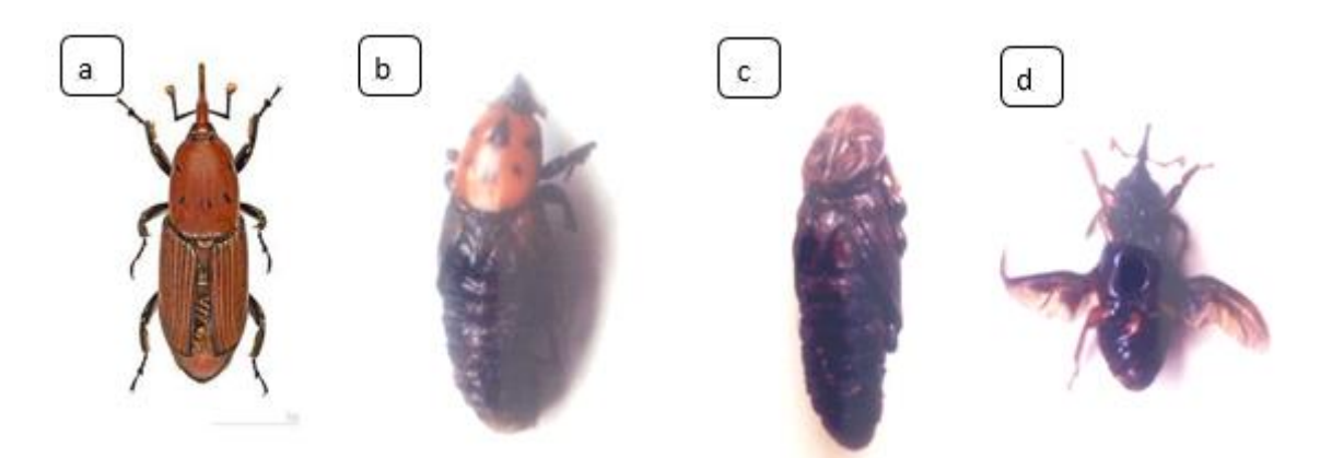
Fig. 1. The most important malformations of Rh. ferrugineus adults after treatment the early 5<sup>th</sup> instar larvae with certain insecticidal compounds. a): normal adult, b): pupal-adult intermediate, c): atrophied wings and legs, d): expanded wings.

Conc., a, c, d: see footnote of Table 1.