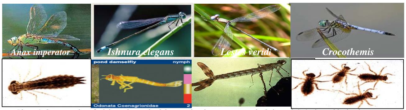
Photo 4: Some species of adults and nymphs Odonata