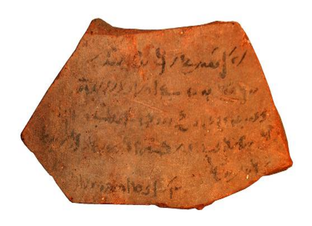
\label{lem:continuous} \textit{Unpublished Demotic Ostracon from Medinet Habu Dealing with Poll Tax} \\ Plate \ I