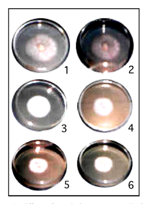
Figure (1): Effects of tested plant extracts on Trichoderma viride growth: (1) Lippia nodiflora, (2) Alhagi maurorum, (3) Zygophyllum album, (4) Tribulus terrestris, (5) Pergularia tomentosa, and (6) Spergularia marina.